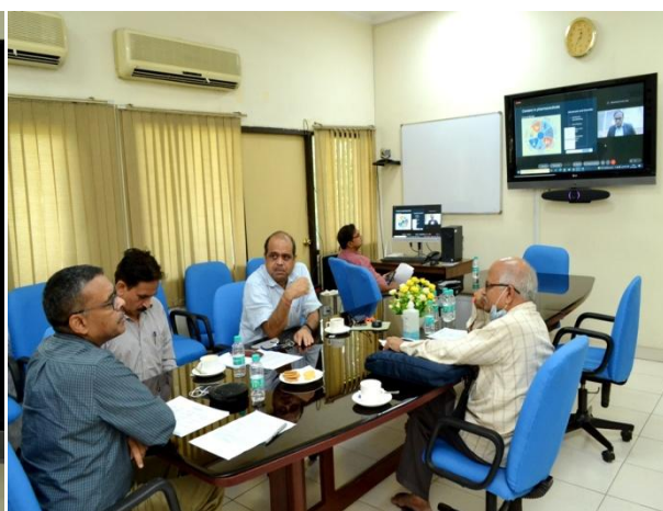
Professors of NIPER, Mohali attending Alumni presentations on 7 th October, 2021